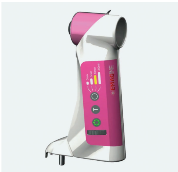
Figure 1. The C-Eye device is designed to perform CXL at the slit lamp.