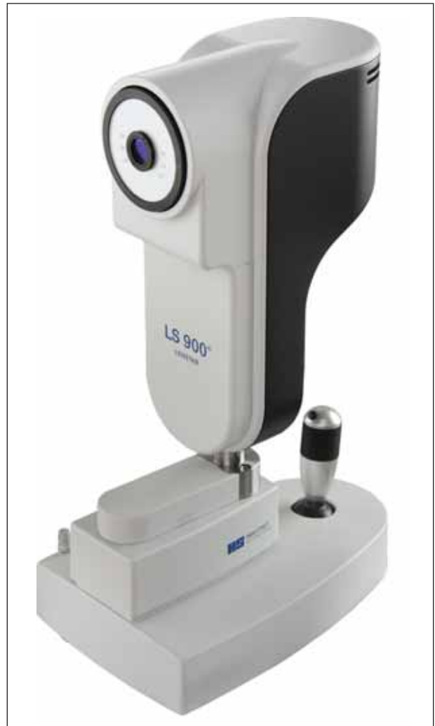
Figure 1. The Lenstar LS 900 simultaneously calculates seven optical measurements.

The operator is quickly able to validate that the placement of the electronic calipers are in the correct position prior to accepting each measurement. The LENSTAR LS 900 can also be used to measure the post-operative pseudophakic lens thickness, which may be helpful in confirming the correct lens power following a refractive surprise.