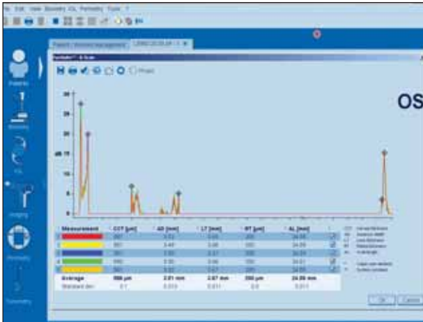
Figure 3. Anterior chamber depth, lens thickness, and the refractive axial length are simultaneously achieved using optical biometry.

Dr. Hill: The operator needs to look at the positions of the electronic calipers to confirm that they are in the correct location. If any of the calipers end up in the wrong place, they are simply repositioned. After the positions of the electronic calipers for each measurement have been confirmed, if any significant outliers are identified, they are removed. Additional measurements can be taken if needed. So, rather than just accepting a number, the operator is able to validate each component and make adjustments as needed. However, it is uncommon that the electronic calipers need to be adjusted.