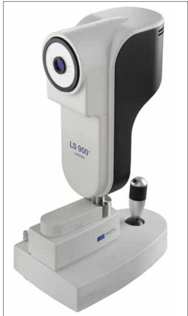
Figure 1. The Lenstar LS 900 simultaneously calculates seven optical measurements.

The operator is quickly able to validate that the placement of the electronic calipers are in the correct position prior to accepting each measurement. The LENSTAR LS 900 can also be used to measure the post-operative pseudophakic lens thickness, which may be helpful in confirming the correct lens power following a refractive surprise.