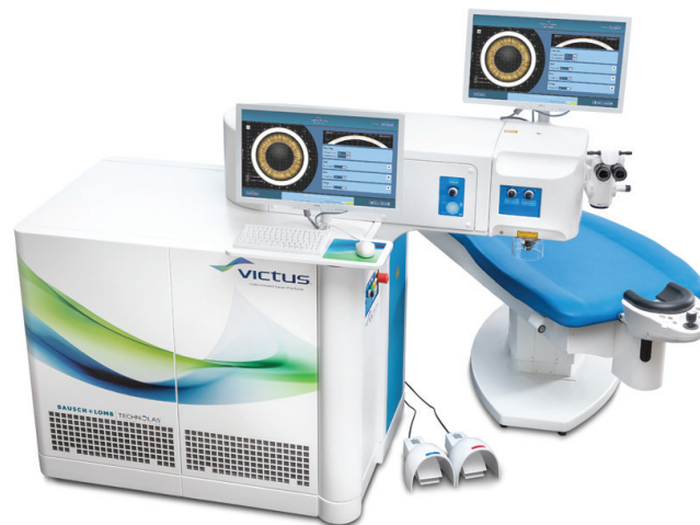
Figure 1. The Victus femtosecond laser system.

Safety, quality of vision, and personalized attention to patients are the cornerstones of a premium procedure. Yet safety is often