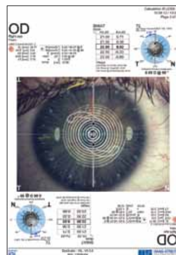
Figure 4. A printout of the toric plan, ready to be used in the OR, with all available data in right side up and upside-down views to allow use of the sketch independent of the surgeon's operating position.

With the LENSTAR and T-Cone toric surgery-planning platform, Haag-Streit provides surgeons with an integrated solution for sophisticated planning of toric IOL implantation. Based on biometry data of the whole eye and using the latest IOL calculation methodologies such as the Olsen formula, the EyeSuite IOL toric planner allows optimized planning of the entire surgical procedure, from incision placement, IOL orientation, and cylinder power choice to the selection of intraoperatively available landmarks on a high-resolution image of the eye and the surgical planning sketch. The LENSTAR LS 900 is an ideal choice for sophisticated cataract surgery. ■