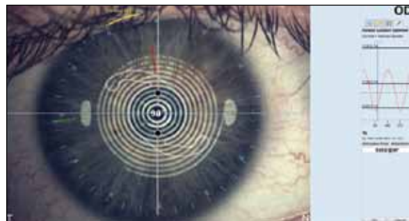
Figure 3. A screenshot of the toric surgery-planning platform. All relevant information is available on the high-resolution image of the eye. The right side shows the optimization tab with the sine plot of the possible incision locations.

The toric surgery-planning platform may be used for any brand and type of toric IOL with the necessary input