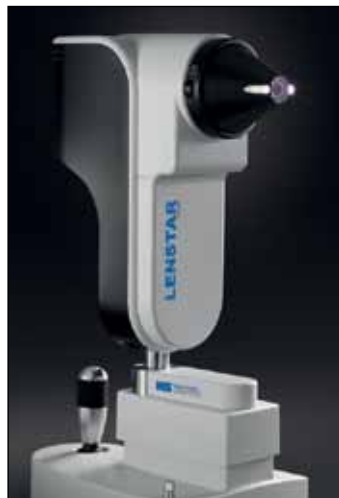
Figure 1. The LENSTAR LS 900 with the T-Cone topography add-on mounted. The planning platform for toric IOL implantation.

The measurement of preoperative corneal astigmatism and axis location is crucial for accurate planning of toric IOL implantation. The LENSTAR's automated dual-zone keratometry (K) with 32 marker points on two concentric rings (2.3 and 1.65 mm in diameter) provides highly accurate axis and astigmatism measurements for planning toric IOL implantation. This was also