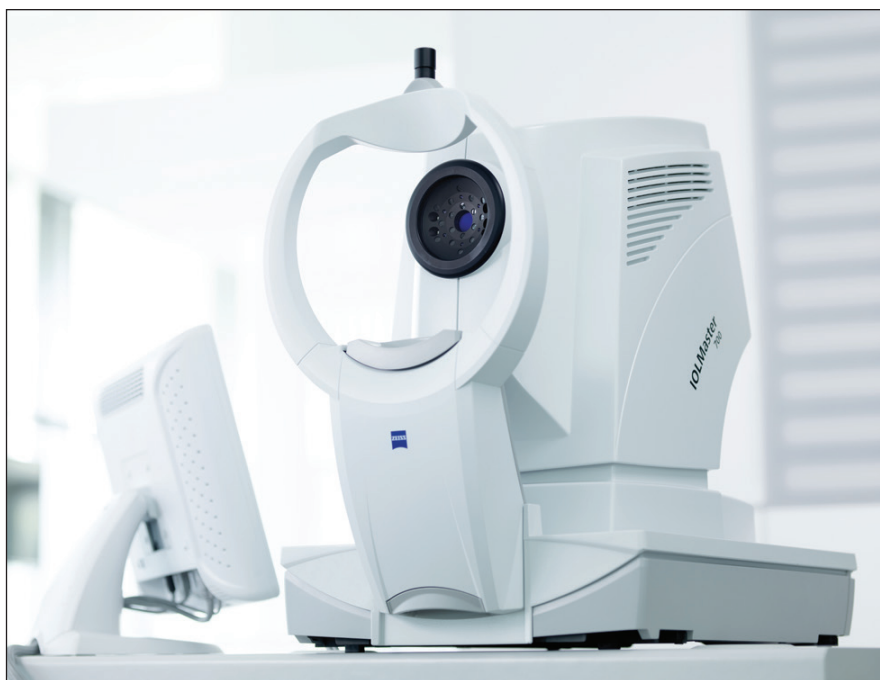
Figure 1. IOLMaster 700 from ZEISS.

A-scans do not provide a true image of the ocular structure being measured, but only peaks and valleys that must be interpreted.