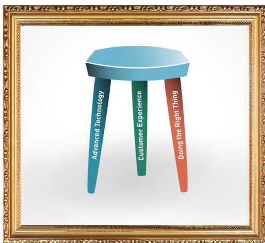
Figure 4. The three pillars of success at Vance Thompson Vision.

needed, and what postoperative drop management (standard drops or drop-a-day option) is called for. Once I complete the surgical plan, the surgeon then comes in to meet the patient, review the surgical plan, and sign off on the chart. I also see most of the postoperative