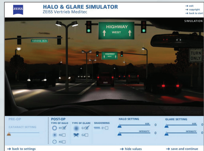
Fig. 2 Halos & Glare Simulation Tool

The binocular defocus curve analysis showed a visual acuity of 3 0.3 logMAR in a range of -2.5 D to +1.5 D and of 3 0.1 logMAR in a range of -1.5 D to +0.5 D. Those results and absence of visual side effects, especially for different intermediate distances ranging from 60 to 90cm were the main reason for the patient's high satisfaction.