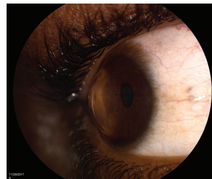
Figure 1. Keratoconus in a young patient requiring CXL.

Cataract surgery is now a refractive procedure, and patients have high expectations for good UCVA after surgery. Patients with keratoconus who have been successful in achieving good quality BCVA with rigid or scleral contact lenses often expect cataract surgery to yield similar outcomes, despite the fact that they present considerably greater challenges to their surgeons.