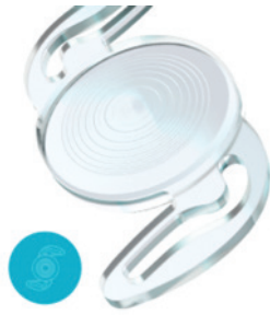
Figure 1. The RayOne Trifocal IOL.

achieve better intermediate visual acuity with a trifocal IOL than with a bifocal IOL without any adverse effect on distance or near acuity. 8