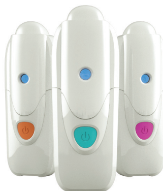
Figure 2. The Optejet dispenser.