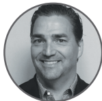
KEITH A. WALTER, MD, FACS

Overall, the goals are to stabilize the cornea and then maximize optical quality and spectacle independence through IOL selection.