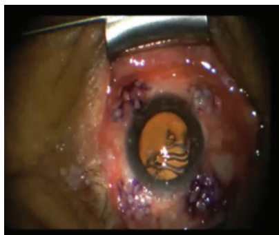
Figure 2. The LSM procedure performed with the VisioLite device. Reprinted with permission from Hipsley et al. 11