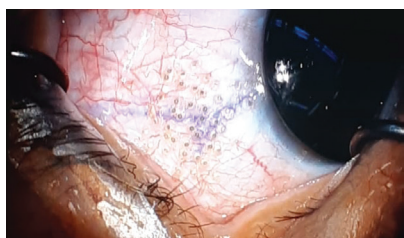
Figure 3. The LSM procedure performed with the VisioLite Gen I MP device.