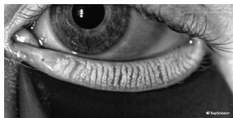
Figure 1. Dynamic illumination with the LipiScan shows normal meibomian gland acini without dropout.