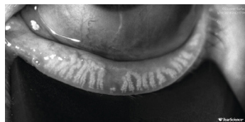
Figure 2. LipiScan image showing meibomian gland atrophy and a loss of acini.