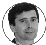
PAVEL STODULKA, MD, PHD

If PRK is planned, it would be important to discuss postoperative recovery with the patient in advance and to administer mitomycin C for at least 30 seconds during the procedure to reduce the risk of postoperative haze.