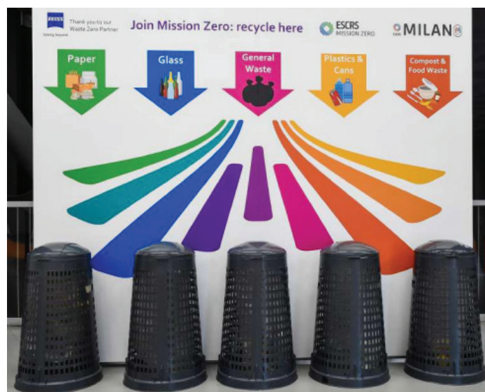
Figure 1. At the 2022 ESCRS Annual Meeting, food was separated into five containers for paper, glass, general waste, plastic and cans, and compost and food waste.

EyeSustain. The ESCRS is partnering with the AAO and ASCRS on EyeSustain, a global coalition of eye societies and ophthalmologists collaborating to make ophthalmic care and surgery more sustainable. EyeSustain works to engage, network with, and educate the global ophthalmic community about more sustainable practices; collaborate with industry to reduce its carbon footprint and surgical