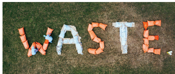
Figure 2. One day’s worth of surgical waste from the Hanusch Eye Clinic in Vienna.

waste (Figure 2); and support research and innovative solutions that reduce ophthalmology’s environmental impact.