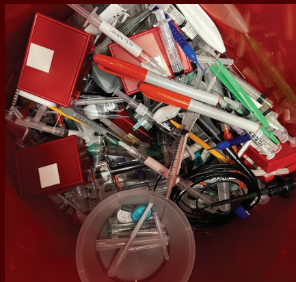
Figure 2. Marking pens, bottles of balanced salt solution, needle containers, and unfinished drug bottles are common objects in ophthalmology ORs.