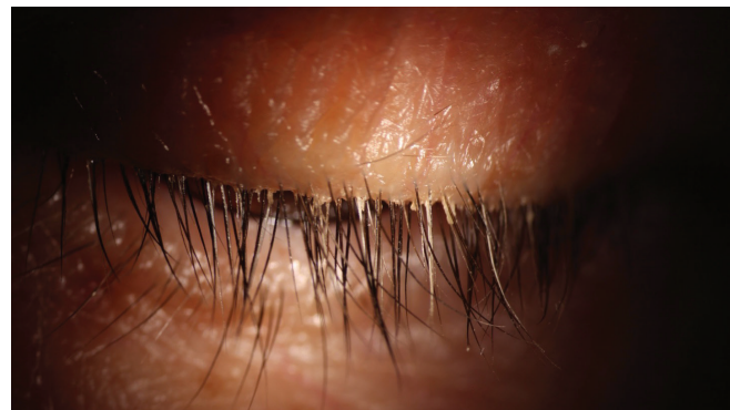
Figure. Collarettes along the upper lash line.

Tear film homeostasis. No matter the mechanism, a loss of tear film homeostasis is key to both aqueous deficient and evaporative DED. The loss leads to a cytokine cascade that must be addressed. A pulse early on of topical steroid eye drops such as loteprednol etabonate ophthalmic suspension 0.5% (Lotemax, Bausch + Lomb) or loteprednol etabonate ophthalmic suspension 0.25% (Eysuvis, Kala Pharmaceuticals) can help decrease ocular surface and tear film inflammation rapidly. This class of medication is not appropriate for the long-term management of DED owing to the risk of steroid-induced ocular hypertension and glaucoma. During the perioperative period, however,