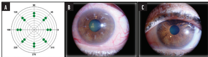
Figure 1. Opti-K features. Pattern of spots on the cornea. Scale: 0.5-mm intervals (A). Immediately after treatment (B). Same eye 1 week after treatment (C).