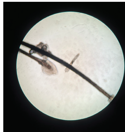
Figure 2. Microscopic view of D folliculorum attached to an eyelash.